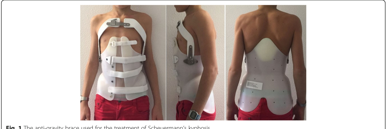
Fig. 1 The anti-gravity brace used for the treatment of Scheuermann's kyphosis

To avoid the great variance in the range of curve angles in thoracic kyphosis that rely on the radiological position, x-rays were performed all at our Radiology Department observing the following position: standing with head straight, arms bent at 45° and hands placed on a support.