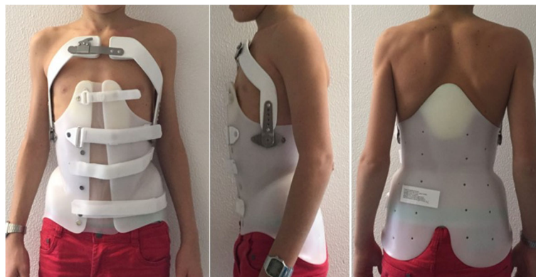
Fig. 1 The anti-gravity brace used for the treatment of Scheuermann’s kyphosis

To avoid the great variance in the range of curve angles in thoracic kyphosis that rely on the radiological position, x-rays were performed all at our Radiology Department observing the following position: standing with head straight, arms bent at 45^\circ and hands placed on a support.