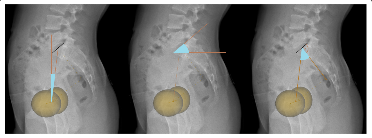
Fig. 3 Measured pelvic parameters. From left to right: pelvic tilt, sacral slope, and pelvic incidence

Fig. 2 Measured spine parameters. The left picture shows the line of the superior endplate of the upper vertebra of the scoliotic curve and the line of the inferior end plate of the lower vertebra of the curve; the complementary angle of these lines is the Cobb angle The right picture shows the sagittal parameters. The kyphosis and lordosis parameters are defined as the angle between the superior endplate of the upper vertebra and inferior endplate surface of the lower vertebra