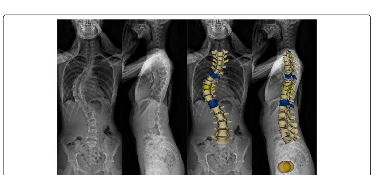
Fig. 1 EOS 3D reconstruction. EOS scan and 3D reconstruction of a 16-year-old female patient with AIS. Cobb angle 67°; Lenke classification, 1AN

For the Lenke subclassification, the central sacral vertical line (CSVL) and sagittal plane curvature of T2–T5 kyphosis, T5–T12 kyphosis, and T10–L2 kyphosis were also evaluated.