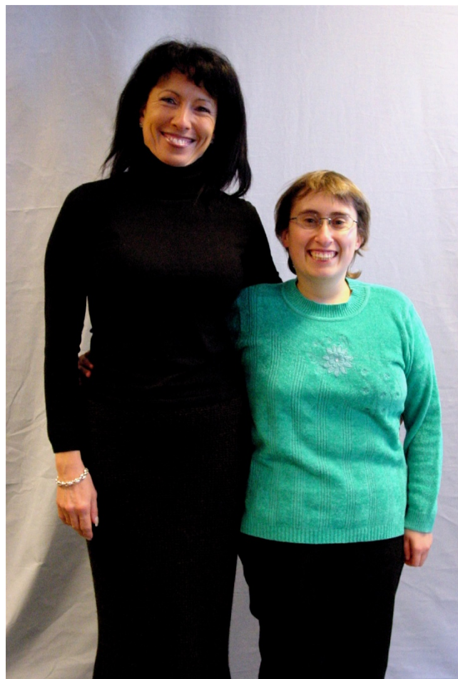
Figure 1 Short statured Patient with only little overweight according to regular exercising. This 24 year old woman with PWS is short statured, compared to her mother next to her on this picture. She has been very obese, while under brace treatment, however with good intake control of food, regular exercising and after having gone through 3 phases of in-patient rehabilitation during the time of brace treatment, she does not seem to be overweight now.

Patel et al demonstrated that PWS patients may have significantly raised levels of the inflammatory marker hs-CRP and evidence of microcirculatory dysfunction, both of which are associated with coronary artery disease and